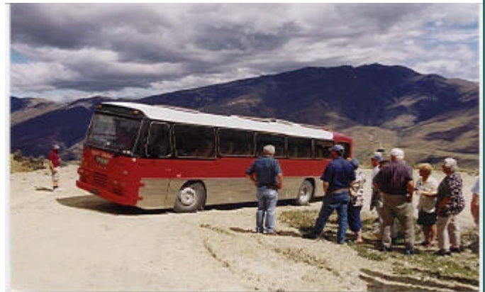
On the road by coach. What a waste of a good VFR day!

Hosted by the local Rotary club. The weather was near perfect with 35 members attending including 12 from Australia. Most of the Australians hired cars in Christchurch and enjoyed an extended stay in New Zealand touring around the South